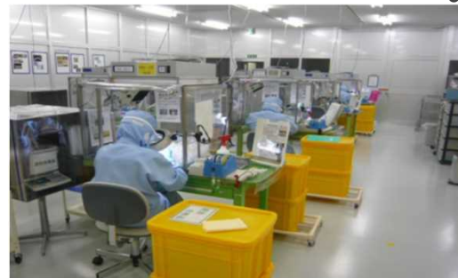
Inspection / finishing process